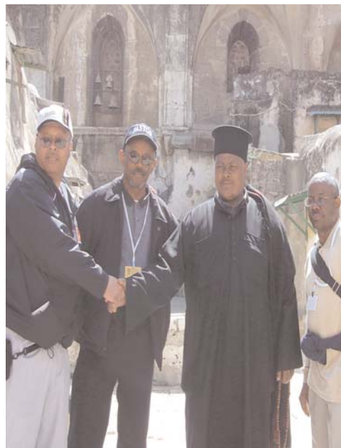
Meet the Christians of the Holy Land, the "Living Stones"!

*Note: The Cairo Route of the Exodus Extension and the Egypt Luxor Extension will operate together on Days 10-12